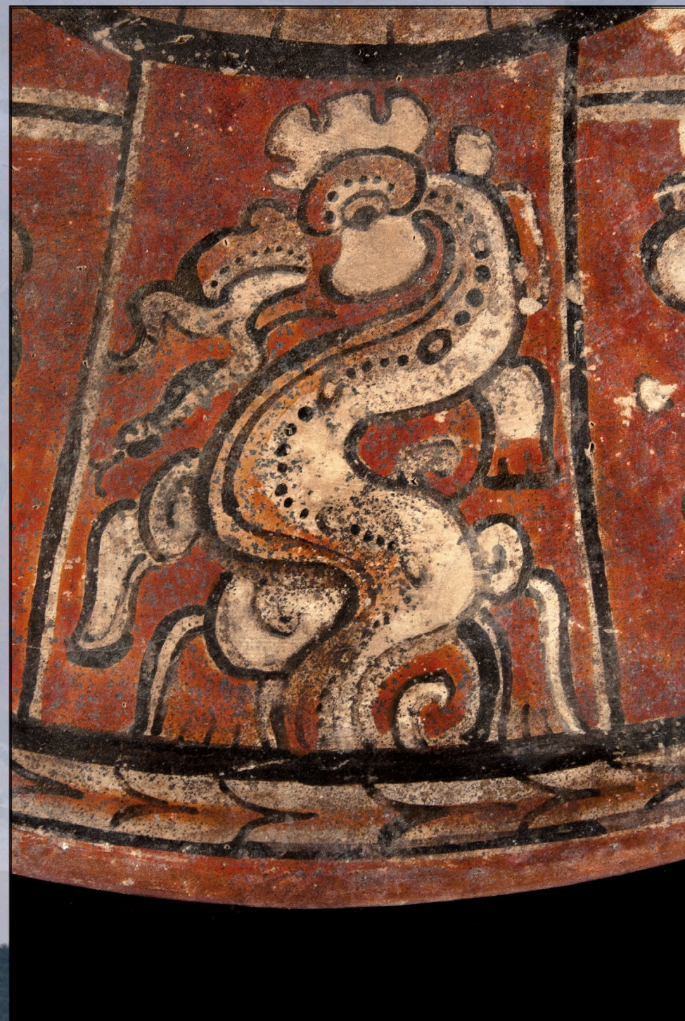
Temple of the Night Sun 272