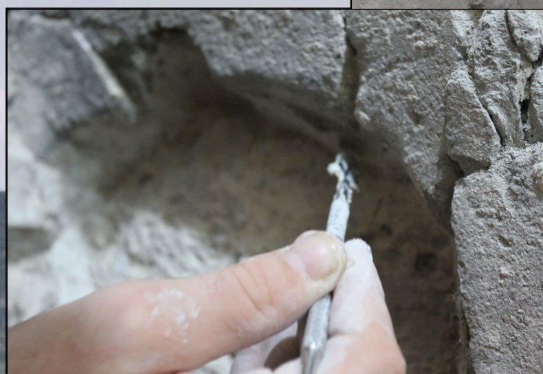
Temple of the Night Sun: west façade and conservation of stuccos.