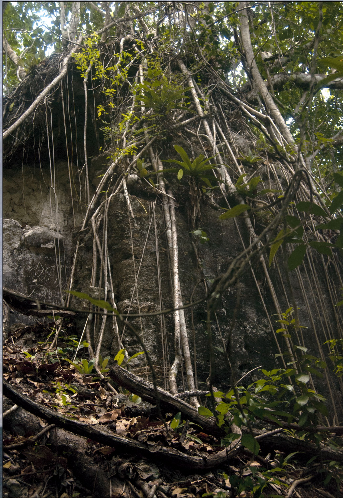
Palace structure, Las Palmitas Group, El Zotz.