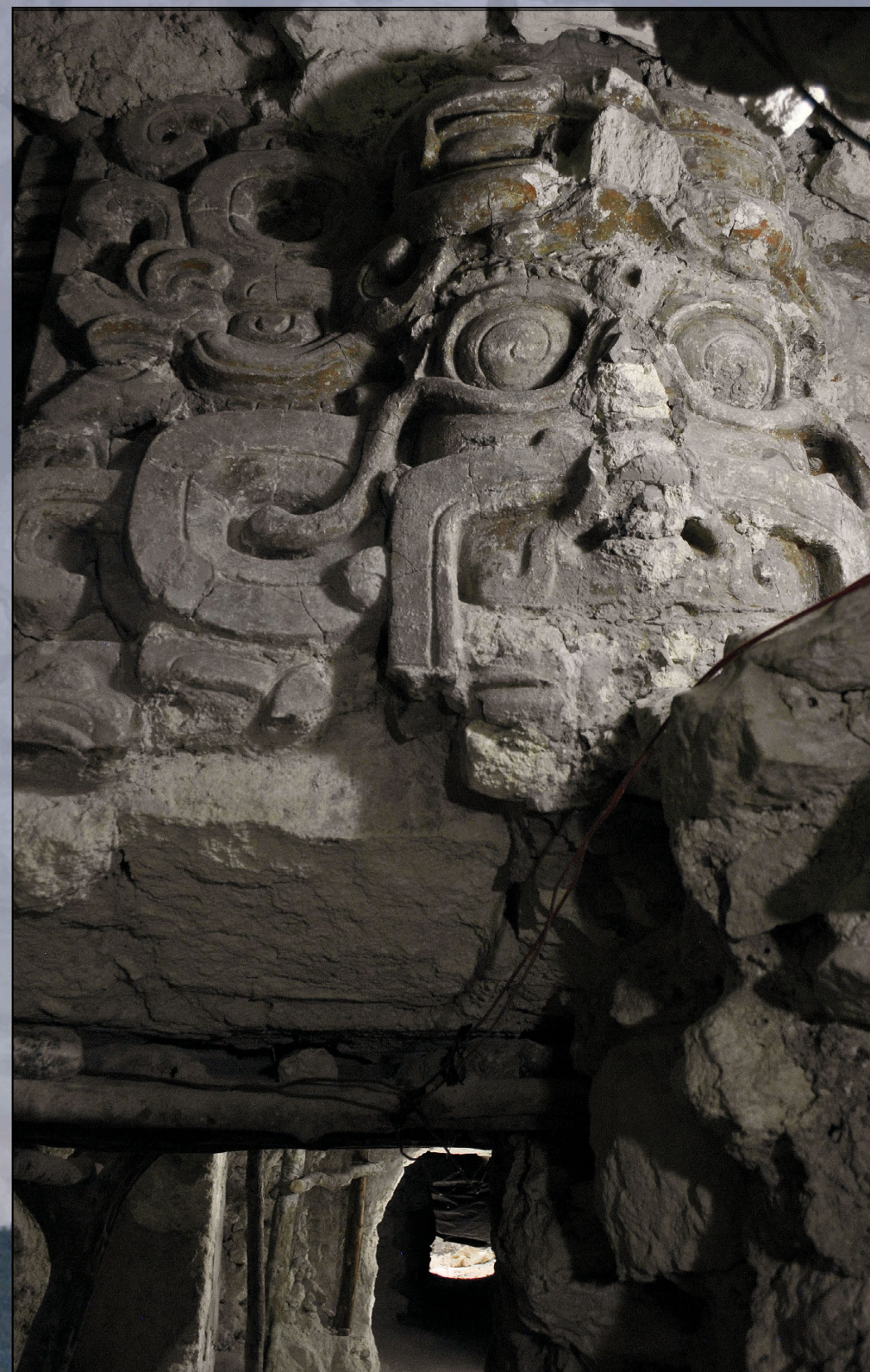
Mask 8 on the western façade of the Temple of the Night Sun.