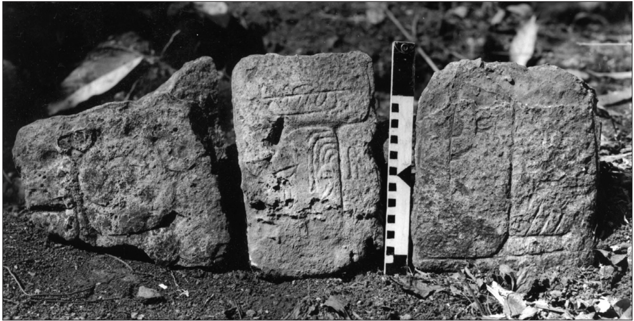
Figure 3. Blocks from La Corona Hieroglyphic Stairway 1 in 1997.

more badly eroded blocks have been recovered since (Figure 3).