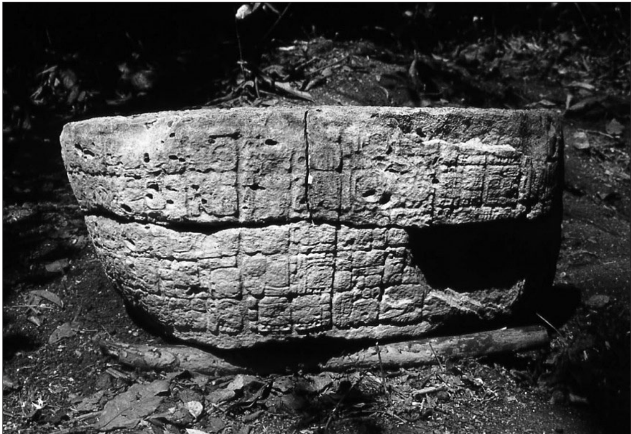
Figure 2. La Corona Altar 2 as reconstructed in 1997. A fragment corresponding to the gap at lower right was found in 2011.

When the ruins of La Corona were first systematically explored in 1997 by Graham and Stuart, several stelae and altars were found and given numbers (Graham 1997, 2010; Stuart 2001). These were Stelae 1 and 2 and Altars 1 through 4, all of which were discovered in situ, mostly concentrated in the main plaza. Altar 4, one of the latest sculptures of La Corona, was first found in many scattered fragments but reconstructed during that initial visit (Figure 2; an additional piece of Altar 4 was discovered by Bruce Love in 2011). Also discovered at that time were a number of small inscribed slabs near the south side of the plaza, which clearly were the facing stones of a stairway. These were given the collective designation of Hieroglyphic Stairway 1, and many