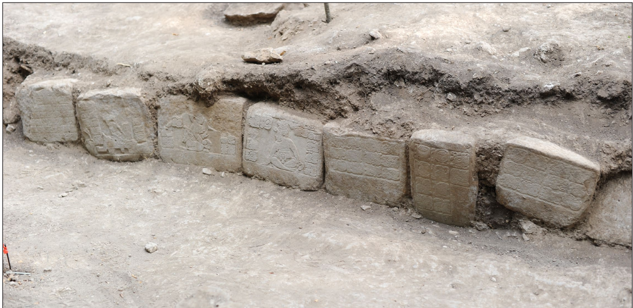
Figure 6. The in situ portion of Hieroglyphic Stairway 2, soon after its discovery in 2012

The discovery in 2012 of twenty-two inscribed blocks on or near the stairway of Structure 13R-10 (Ponce 2014; Ponce and Cajas 2013) now forces us to reevaluate these earlier systems (Figures 6 and 7). This monument — an archaeologically documented stairway consisting of inscribed blocks — by all rights deserved the designation “Hieroglyphic Stairway 2.” Moreover, it immediately was apparent that the ancient