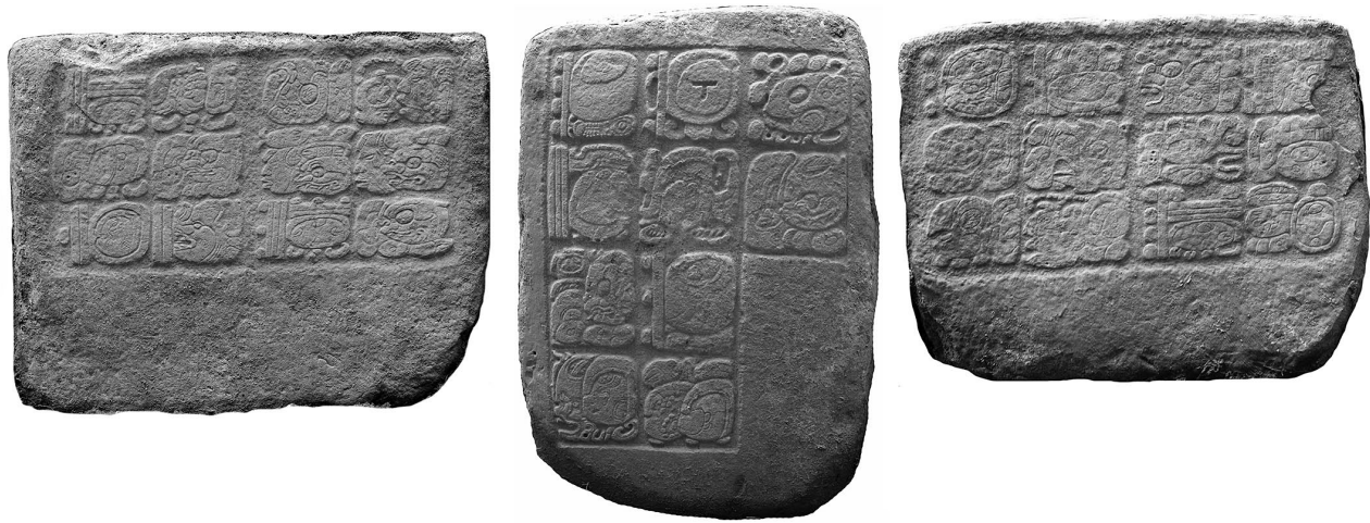
Figure 8. Blocks 9, 10, and 11 of La Corona, Hieroglyphic Stairway 2 (Elements 37, 38, and 39).

public and private collections, (2) the many stones that the ancient Maya themselves removed from other locales and placed in secondary context, principally in and around Structure 13R-10.