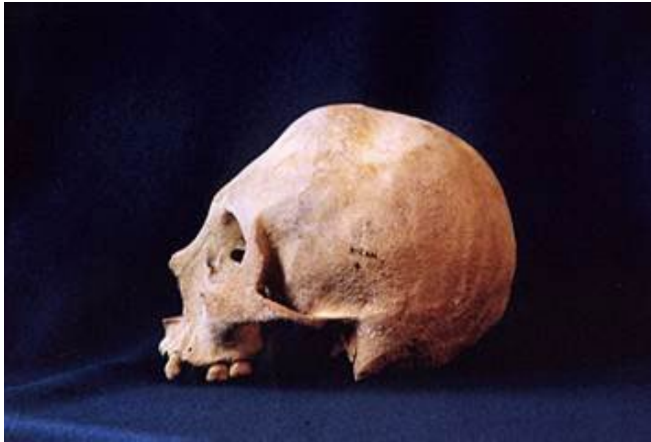
Figure 2. Tabular oblique shape, achieved by the use of a headcompression apparatus; Xcan, Yucatán, Mexico; Classic Period.