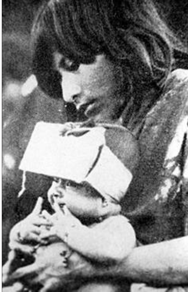
Figure 3. Head-shaping instrument used by the Chama (after Dávalos 1951).