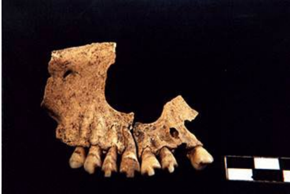
Figure 6. Dental decoration by filing; Dzibilchaltun, Yucatán, Mexico; Postclassic Period.