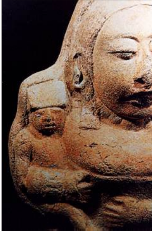
Figure 4. Head-shaping instrument in pre-Hispanic figurine.