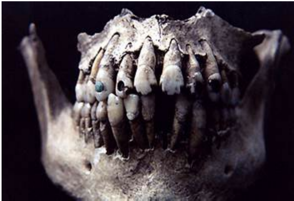
Figure 5. Dental decoration by filing and incrustation methods; Ixtonton, Guatemala; Classic Period.